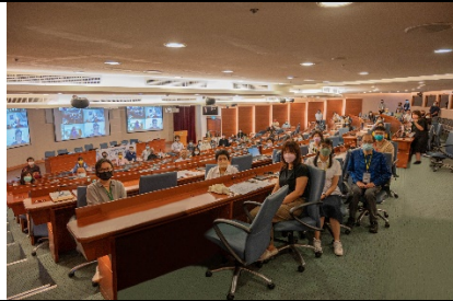
Group photos of the participants of the symposium

WZU organized a Laurel Method workshop on the second day of the symposium, in which WZU teachers shared the Laurel Method with the participants who also experienced hands-on activities.